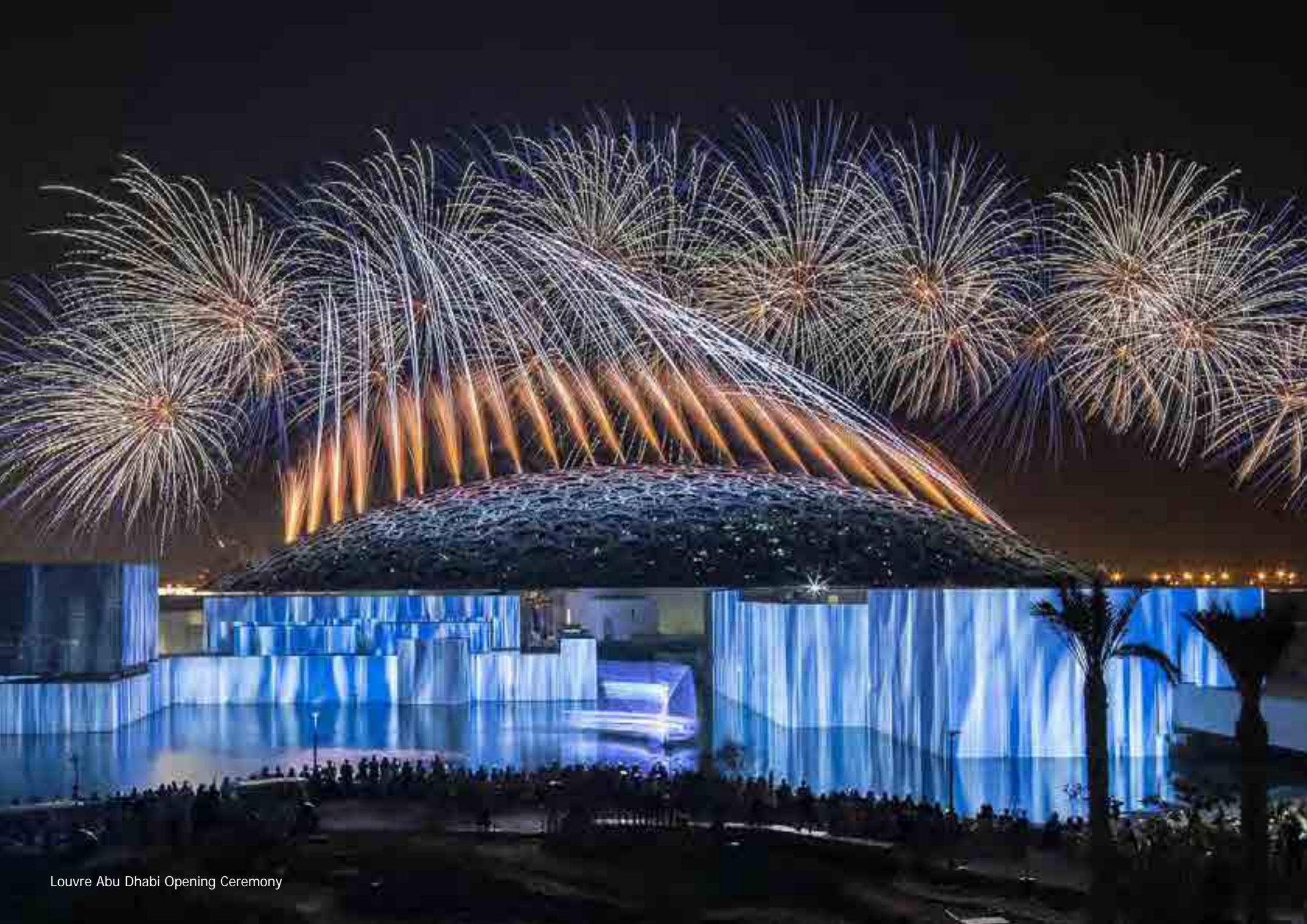
Louvre Abu Dhabi Opening Ceremony