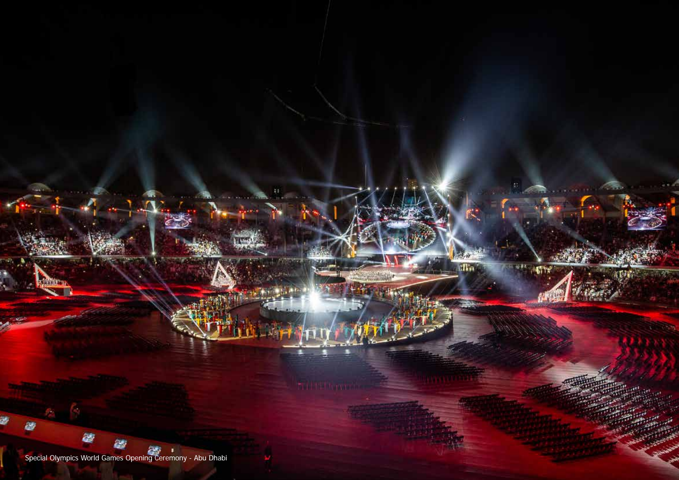
Special Olympics World Games Opening Ceremony - Abu Dhabi