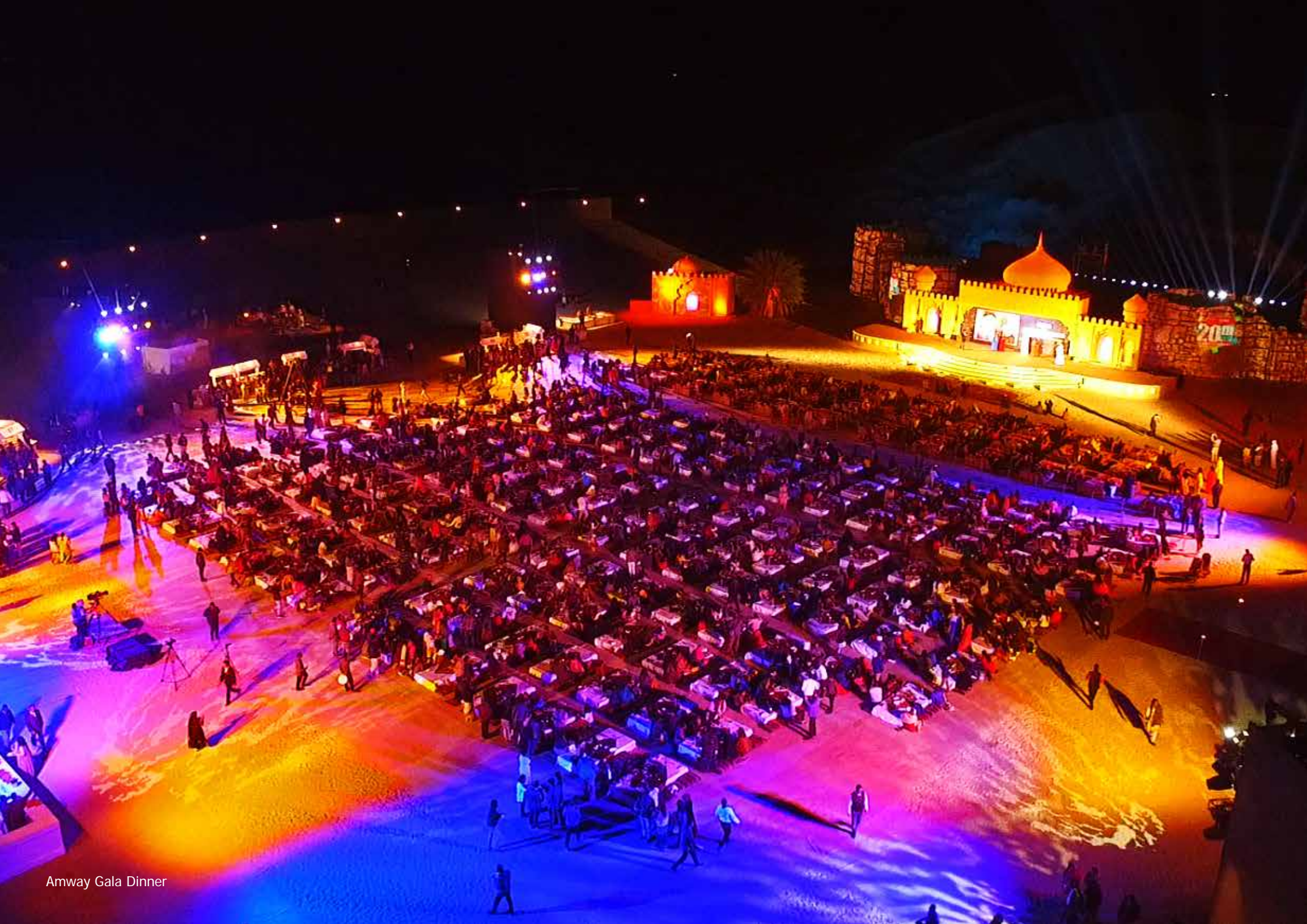
Amway Gala Dinner