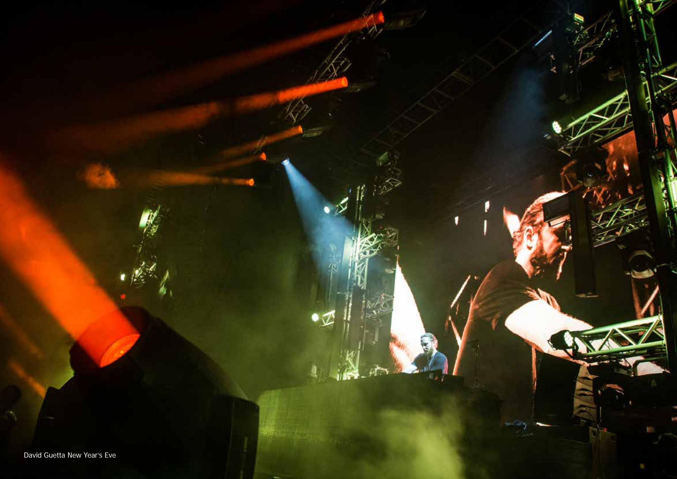
David Guetta New Year's Eve